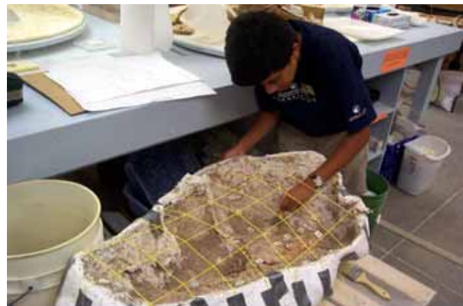
Paleontologist at the Mammoth Site laboratory in Hot Springs, South Dakota, extracts vertebrate fossils from a large block recovered in Wind Cave NP