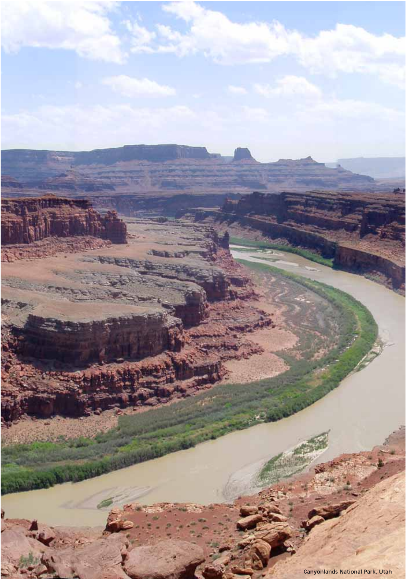
Canyonlands National Park, Utah