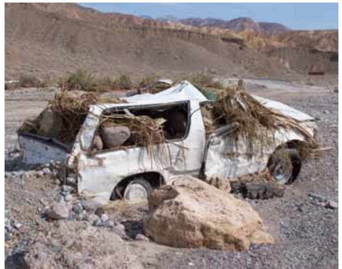
In mid-August, 2004, as much as 4 inches of rain fell in just 6 hours over the Funeral and Green Mountains in Death Valley NP. Extensive flooding washed out roads and mobilized sediment in alluvial fans over a widespread area. Two people lost their lives when their vehicle was entrained in flows within Furnace Creek Wash. NRPC staff from Water Resources and Geologic Resources Divisions assisted the park by identifying field evidence used to determine the magnitude and frequency of this event, as well as flood behavior during various stages.

In 2004, staff assisted parks in evaluating and mitigating geohazards by providing technical expertise to assess uncertainty and develop appropriate actions to reduce the risk to visitors and staff from potential hazards in parks, e.g., rock fall, land slides, geothermal vents, lava flows, flash floods, and mud flows. Highlights for the year included investigation of rock fall concerns at Jewel Cave NM, evaluation of an historic tunnel preservation project at Cowpens NB, assessment of geohazard potential associated with the drilling additional water intake tunnels in Lake Powell for continued operation of the Navajo Generating Plant, and field assessment of the deadly flood and debris flow in Furnace Creek Wash at Death Valley NP. The Jewel Cave evaluation of rock fall potential in the immediate area of the cave elevator doors will get further assistance from a partnership with the Colorado School of Mines (CSM) Senior Engineering Design Class to research and prepare comprehensive design specifications. The Cowpen's project to preserve the Kosciuszko Tunnel, constructed in the 1780's to breach the fort wall at this American Revolutionary War fort held by the British forces, requires a delicate balance of historic preservation with the high priority for visitor safety.