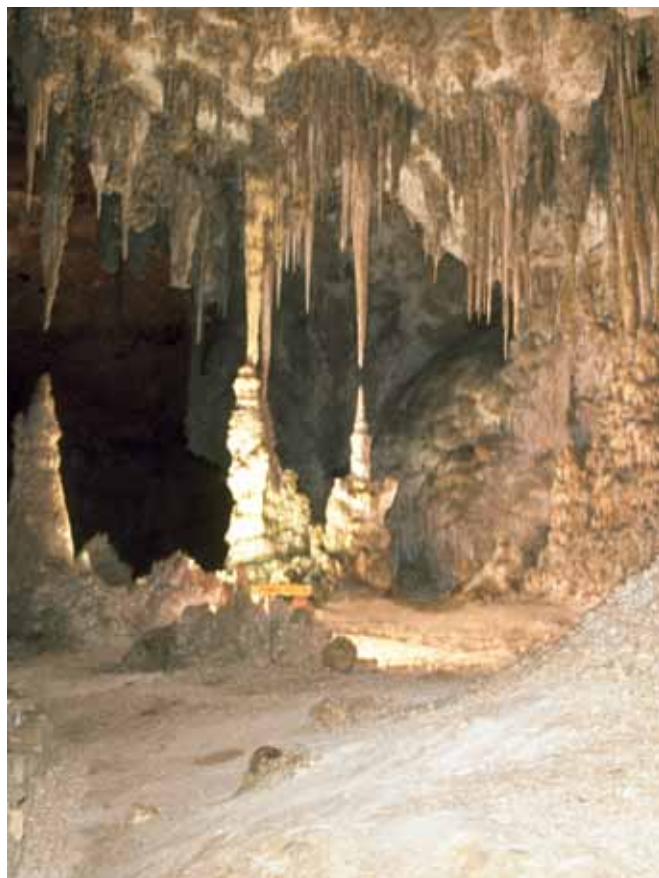
Carlsbad Caverns National Park, New Mexico

A 1998 Act of Congress directed the NPS to establish the National Cave and Karst Research Institute (NCKRI) in the vicinity of Carlsbad, New Mexico. Provisions in the Act included joint administration by the NPS and an administrative partner, and that the expenditure of federal funds be matched by an equal amount of non-Federal funds. The NPS assigned the Geologic Resources Division the lead responsibility for establishing NCKRI in 2000. Congress provided an initial NPS operating appropriation in FY 2001, which led to the Division's hiring of a permanent director duty-stationed in Carlsbad, NM. In FY 2003, Congress appropriated Federal construction funds totaling almost $2 million for a NCKRI building. The State of New Mexico provided the matching non-Federal operating funds in 2001 and building funds in 2003. The unique legislation mandating NCKRI as presented unusual challenges for the NPS and potential partner organizations in our efforts to structure and formally establish the Institute as a fully operating entity.