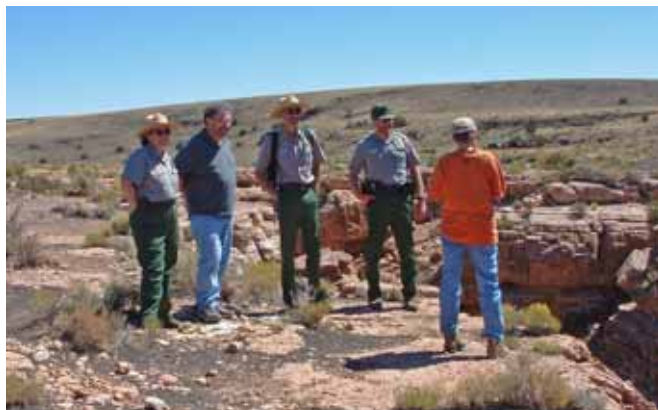
Staff from Wupatki National Monument and the Flagstaff Group discuss the restoration of the entrances of three earth crack features. These earth cracks near the Lomaki ruin were covered in the past to protect livestock from possibly falling in. NPS staff is interested in restoring the entrances to a more natural state.