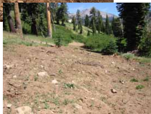
Obliteration and restoration of one of the access roads at an abandoned ski area in Lassen Volcano NP, California. Complete restoration facilitates the reestablishment of native hydrologic patterns, native vegetation, and removes the physical scar. After equipment work, the access road is prepared for hand seeding.

cumulative total of 20,125 acres restored. For the current NPS Strategic Plan, Division staff coordinated updates and review of the Technical Guidance, revising goal targets, and establishing new goal attributes. In addition, Division staff contributed significantly in the development of new GPRA goals regarding watershed health as part of the Department of the Interior's new Strategic Plan.