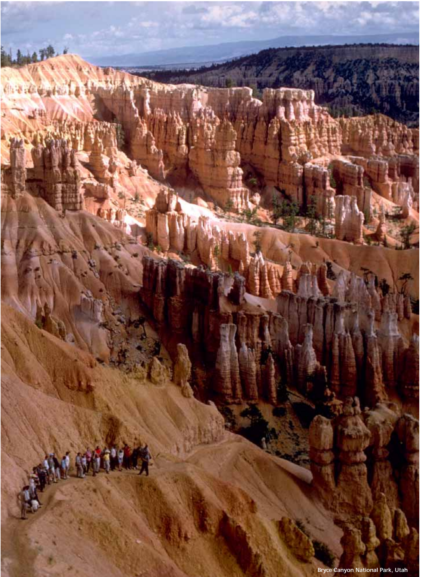
Bryce Canyon National Park, Utah