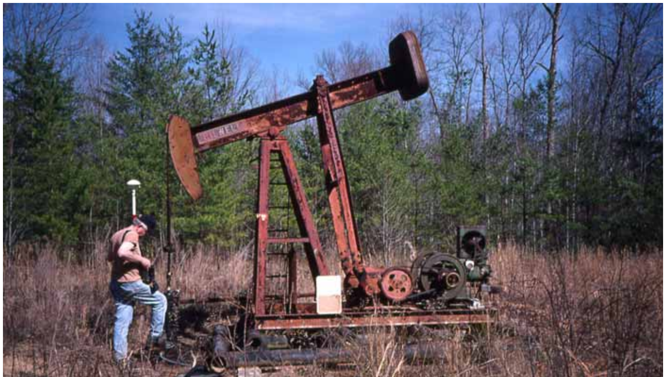
Mike Hoyal, surveys the location of an oil well at Big South Fork National River and Recreation Area, Tennessee.

On lands adjacent to parks, the NPS works with other federal and state permitting agencies, along with mining project proponents, to have park protection measures incorporated in mineral leasing or other energy development decisions. In FY 2004, Division staff assisted park and regional offices as well as other federal and state agencies on a variety of