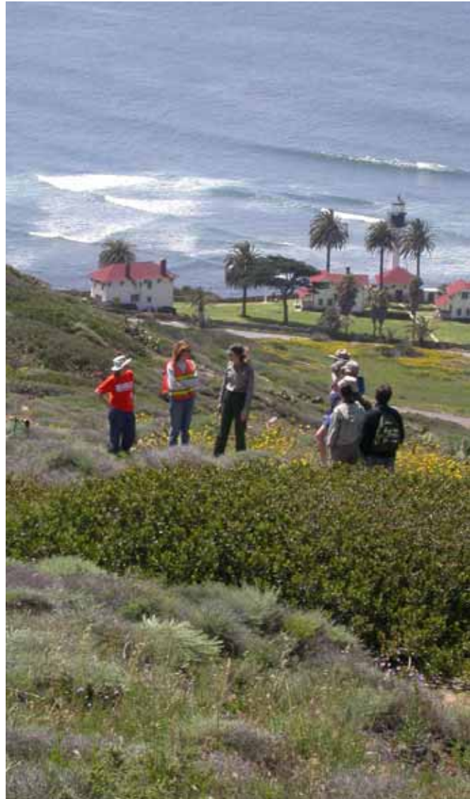
Cabrillo National Monument, California

The Division existing base funding limitations were compounded in FY 2004 by the across-the-board reductions noted above. This resulted in the Division relying on over $79,000 in travel funding from other sources, including other NPS offices and other Federal agencies to provide critical geologic resources management technical assistance and support services to parks. Of particular concern was the need for parks to fund $12,000 for Division staff participation in field projects, causing a financial burden for those parks needing geologic resources management services. The Division also cut back on program travel in FY 2004, for example reducing planned Geologic Resources Evaluation travel by over $16,000. Finally, numerous park requests for technical assistance were not undertaken due to travel constraints.