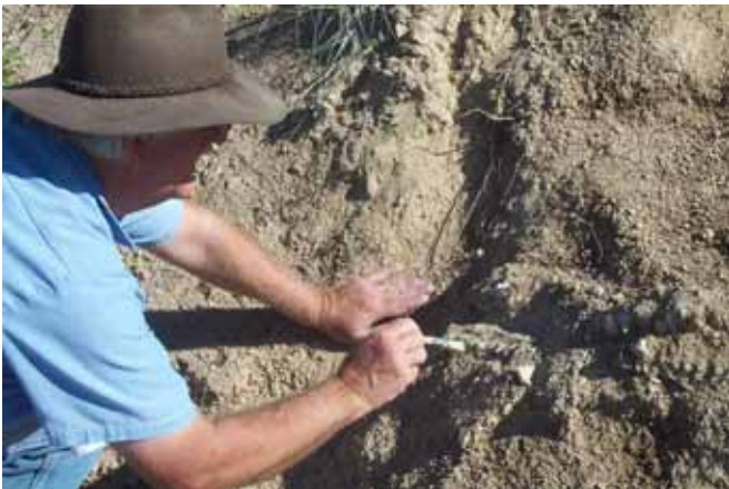
NPS Paleontologist working at a new discovery site in Wind Cave National Park, South Dakota

preparation of the excavated fossils by staff at the Mammoth Site in Hot Springs, South Dakota, and the recruitment of qualified volunteers from the Denver Museum to assist in the fossil preparation efforts. Division staff serves as Servicewide goal contact for GPRA NPS Goal 1a9A - Paleontological Localities. The NPS Strategic Plan target was to have 25% (1,287) of 5,149 known paleontological localities in parks in good condition by September 30, 2004. In FY 2004, parks reported 1,202 (23%) of the 5,149 baseline localities in good condition. This minor shortfall in Servicewide performance was due primarily to the NPS imposing stricter documentation requirements in FY 2004 to achieve Servicewide consistency in reporting annual performance. Also note that parks reported an additional 148 newly discovered and documented fossil localities (not included in the baseline) in good condition in FY 2004. In addition, staff updated the Technical Guidance and established revised targets for NPS Goal 1a9 in the NPS FY 2005-2008 Strategic Plan and prepared Servicewide quarterly accomplishment reports on DOI Resource Stewardship "Natural Heritage Asset" paleontological localities.