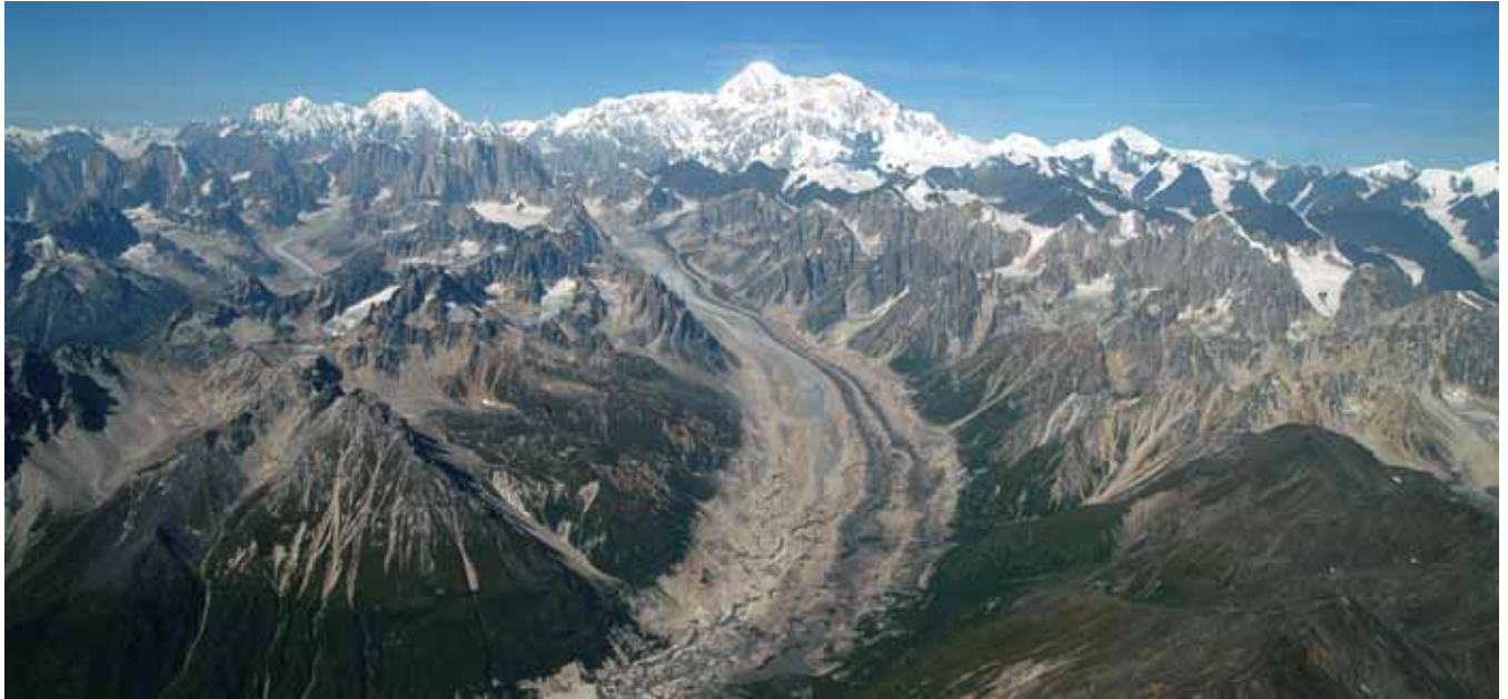
Denali National Park, Alaska