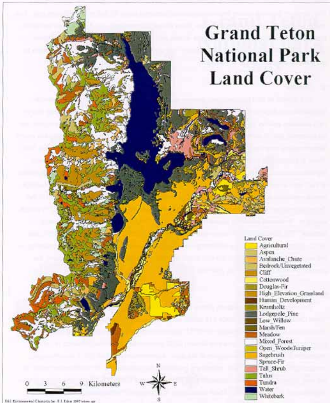
Figure IV-2. Land cover of GRTE.