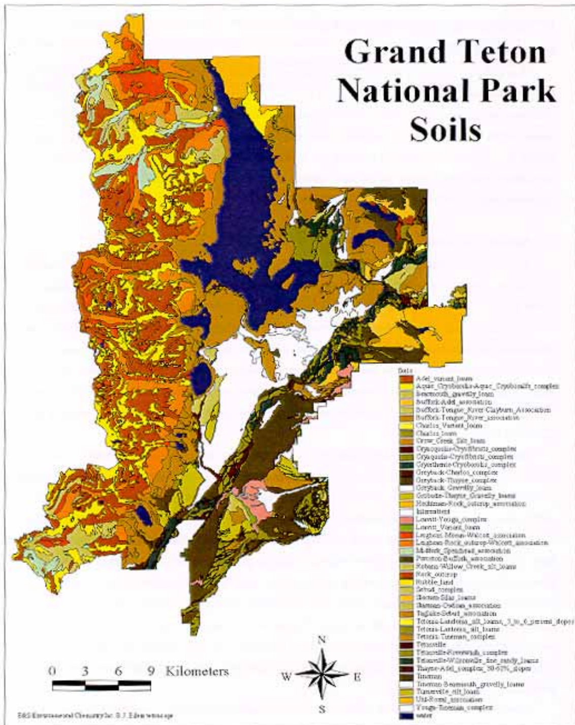
Figure IV-1. Soil classifications of GRTE.