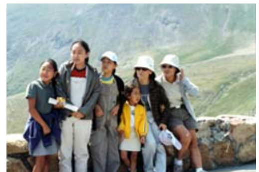
Visitors to Rocky Mountain National Park

The plan is compatible with a number of other efforts including the National Diversity Recruiting Plan and the Department of Interior (DOI) and NPS Human Capital Plans, as well as the efforts of the Recruitment Futures Workgroup.